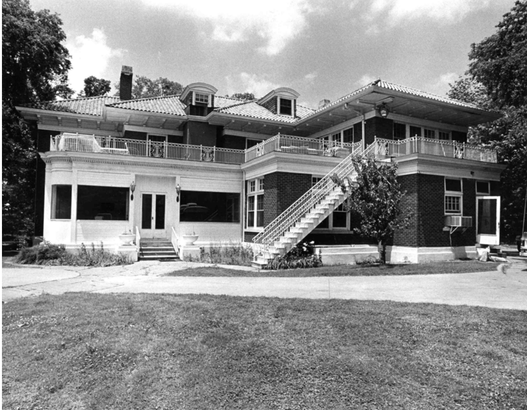
William G. Skelly House